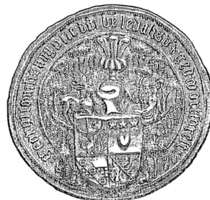
Fig. 10.—Seal of George Douglas, 4th Earl of Angus (1446-1463). [The Seal of James, 3rd Earl of Angus, is similar to the above (4th Earl).]